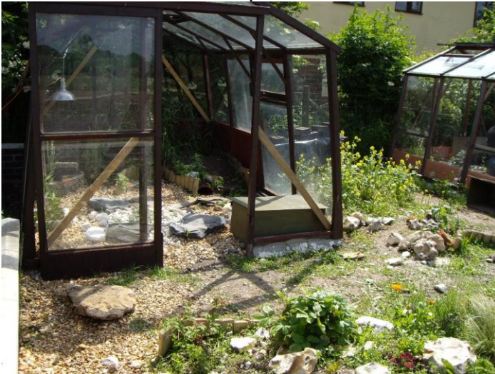
Overview of a Mediterranean setup

This design allows temperate species of tortoise to live outside throughout the year. The cold frame protects them from cold and damp conditions, and also provides extra warmth and light on cooler days during the summer. Tortoises can also hibernate more naturally within the substrate of the cold frame, protected from extreme of temperate by the soil / sand mix. Weeds can be grown from seed in the outdoor pen to create an edible landscape for tortoises to naturally graze.