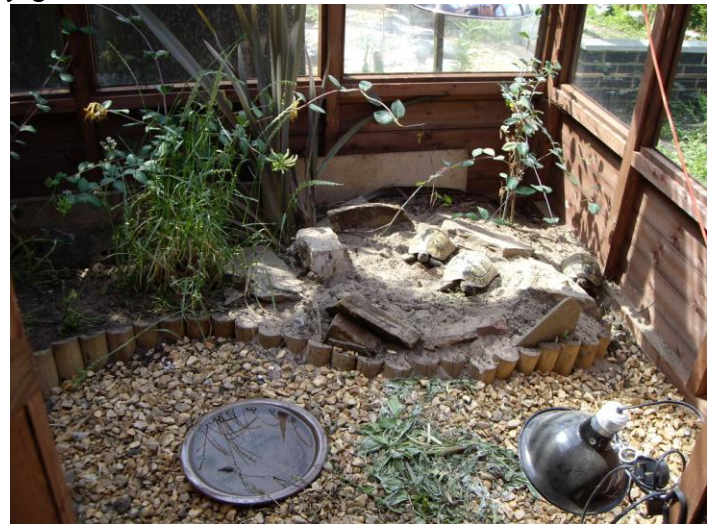
indoor view of setup with heat lamp and nesting area

Animals should always have access to natural sunlight during summer. This is beneficial for both healthy bone development and appetite. Smaller tropical species can also be kept in this type of accommodation during summer although they will need spacious indoor environments throughout the winter. Always have access to freshwater. Never allow sick tortoises to hibernate, seek veterinary help/advice if unsure.